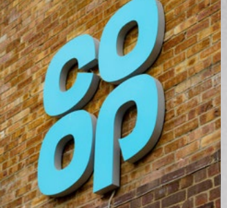
Co-op Food 1 minute's walk from Optima