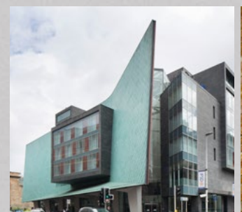
Radisson Blu 5 Star hotel