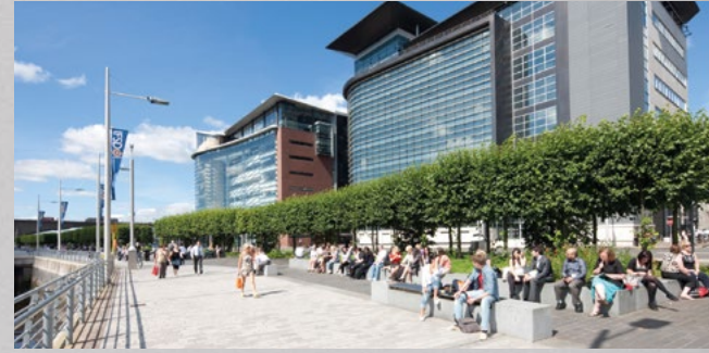
River Clyde Waterfront Just outside the door at Optima