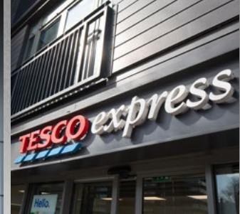
Tesco Express 3 minutes' walk from Optima