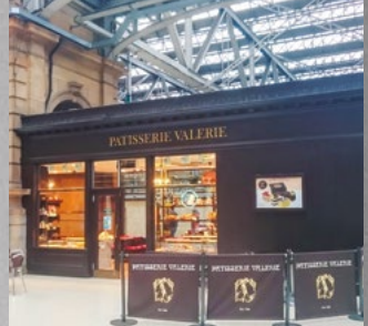
Patisserie Valerie Handmade cakes