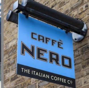
Caffè Nero Italian style coffee house