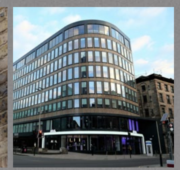
Yotel Cutting-edge new hotel experience