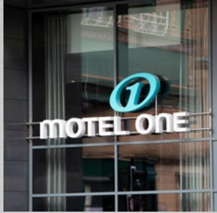
Motel One Affordable design hotel