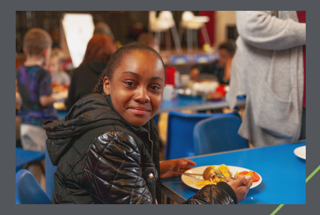
Image Taken at TLG Make Lunch . A Programme that helps feed families that struggle with the holiday hunger gap.