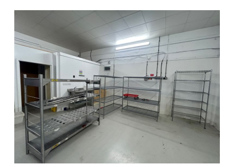
Rent: £18,000 Per annum + VAT Size: 1,550 Square feet Ref: #3153 Status: New on!