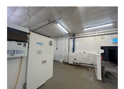
Rent: £21,000 Per annum + VAT Size: 1,844 Square feet Ref: #3152 Status: Reduced