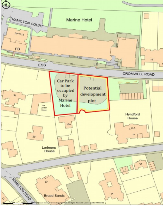
OS Plan B