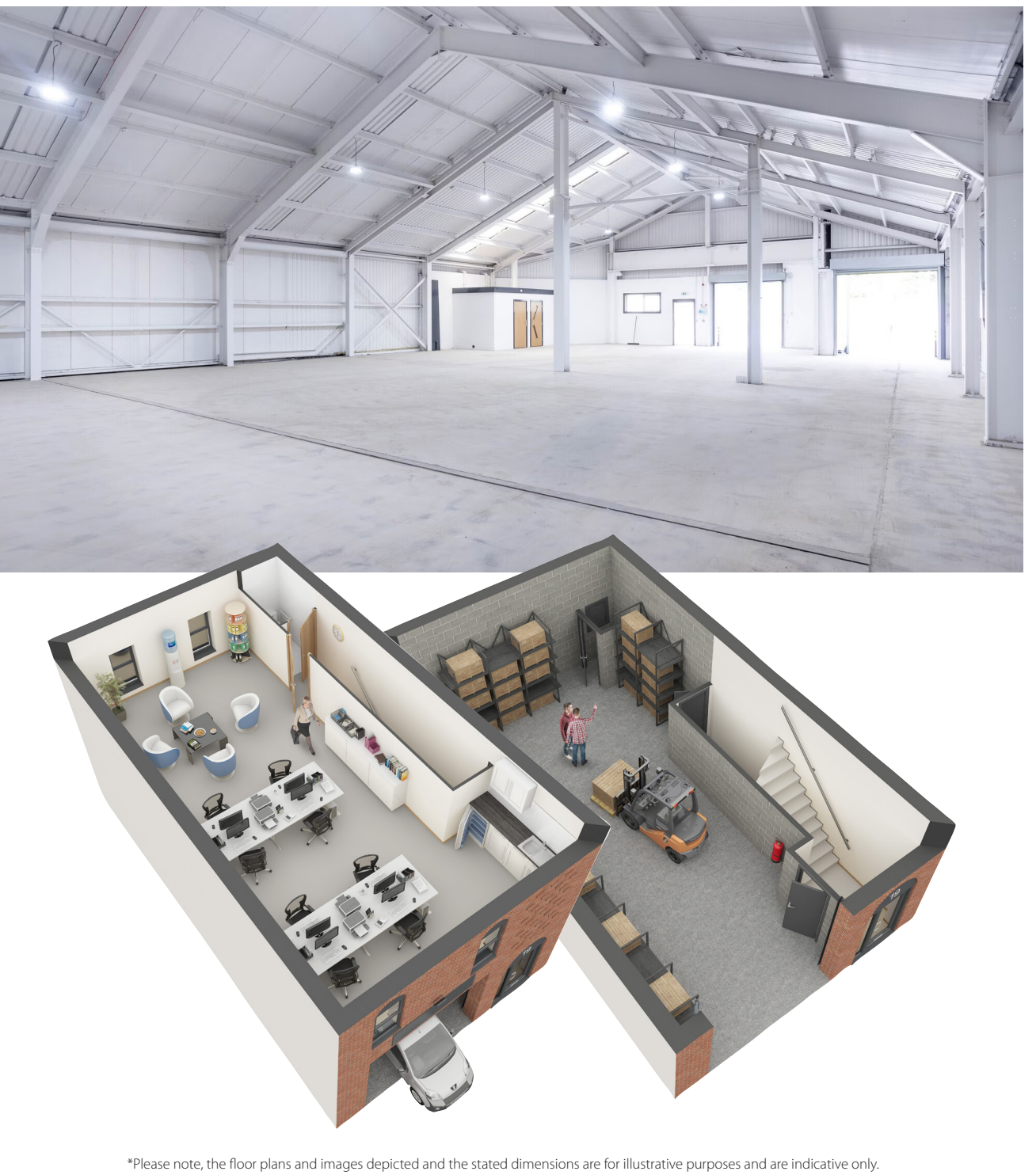
*Please note, the floor plans and images depicted and the stated dimensions are for illustrative purposes and are indicative only. The accuracy of all information should be verified via personal inspection on site.