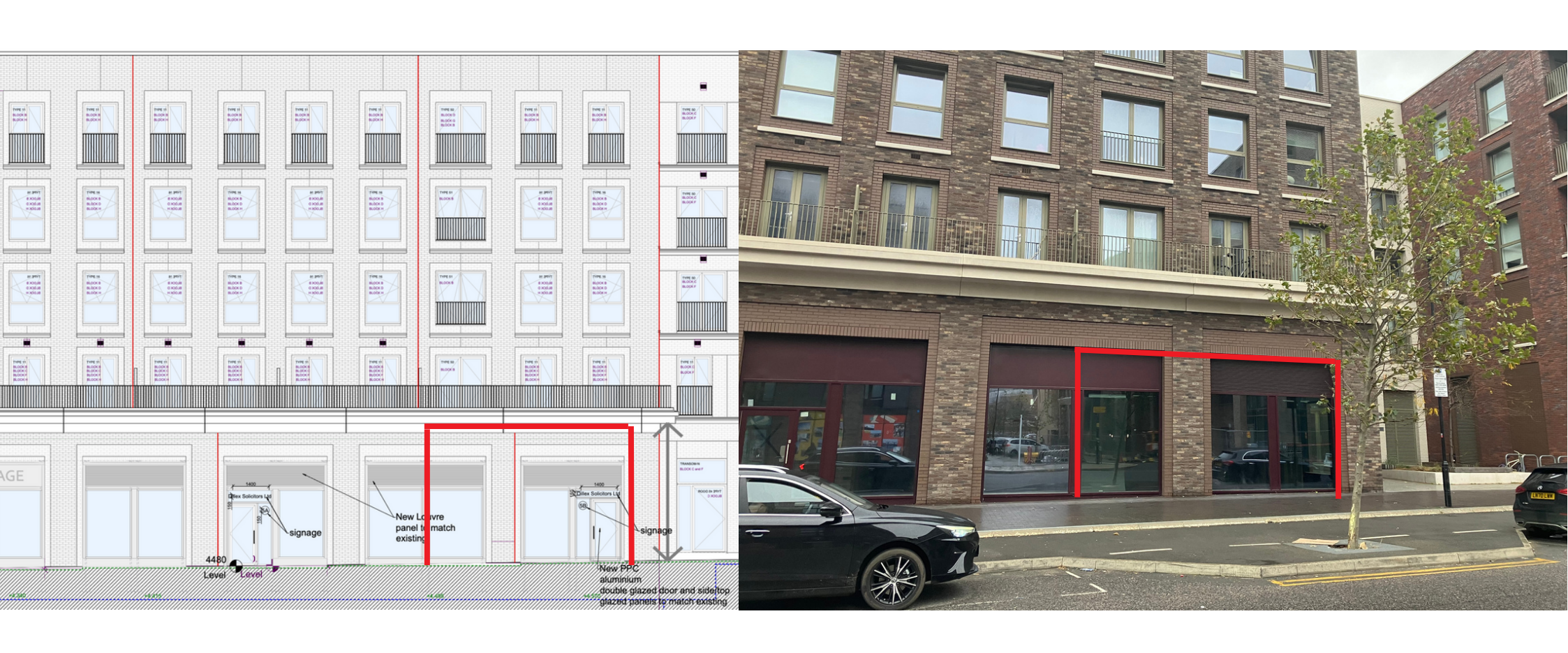
11a Atlantis Avenue, London E16 2UB