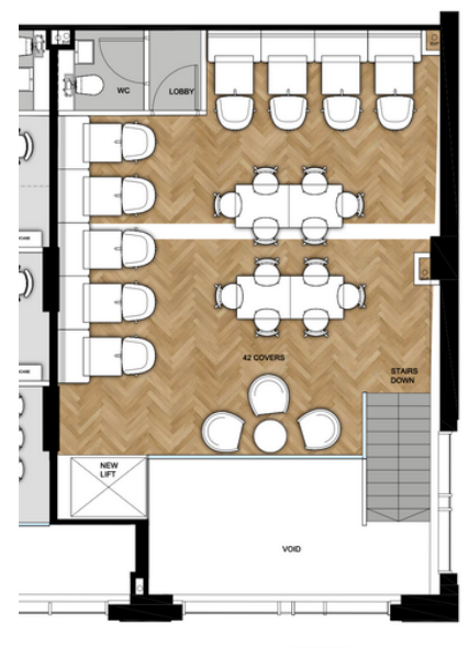
IT 48 - 57 SQM W MEZZANNE FLOOR PLAN - GALLIONS POINT