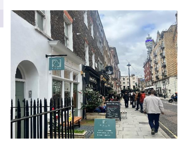
Haug London Haus, Banh Mi Bay and The Newman Arms are all located a short walk away on Rathbone Street

Each party is to be responsible for their own legal fees.