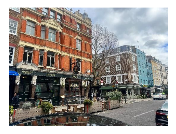
The Fitzroy Tavern located the other end of Charlotte Street, great for after work drinks or celebrations

Local amenities such as Old School Barber Shop, Lisboeta, Pied à Terre and Goode Flowers are just on your doorstep.