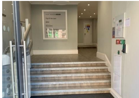
NB Indicative photographs showing space once reinstated to CAT A