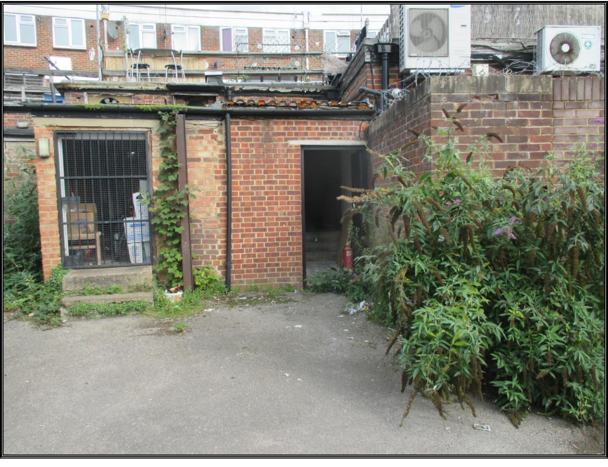
Rear vehicular access