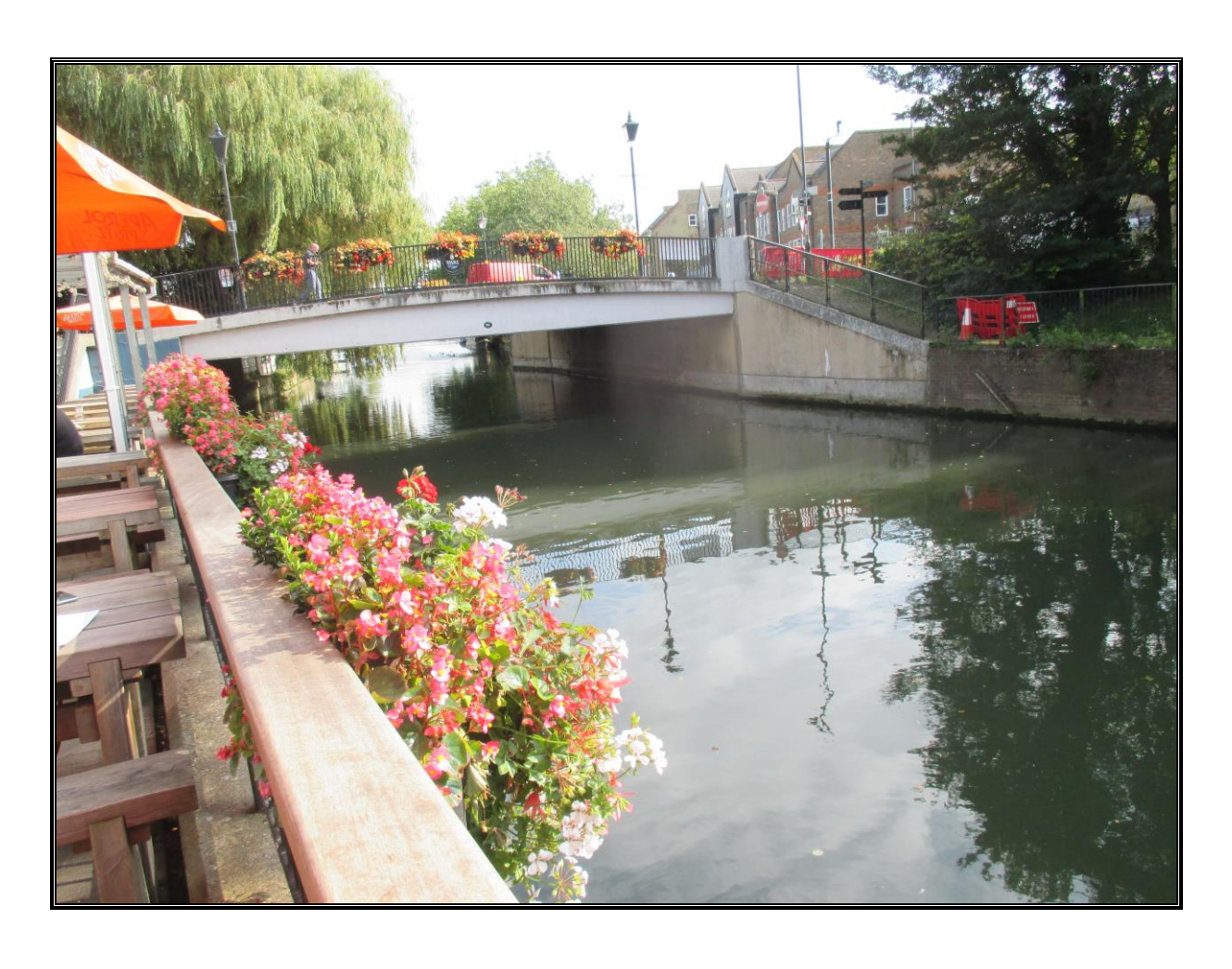
Picturesque River Lea behind the premises