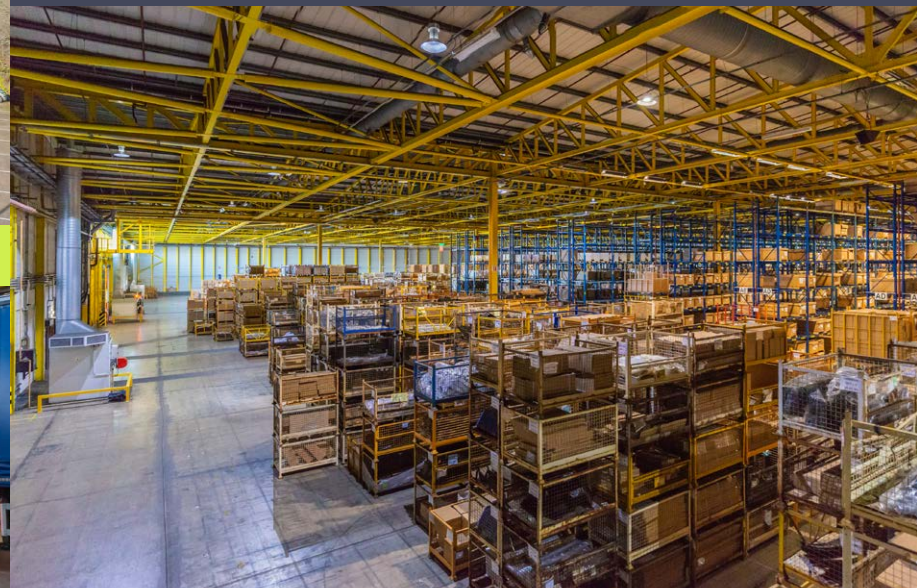
↑ 99,260 SQ FT WAREHOUSE