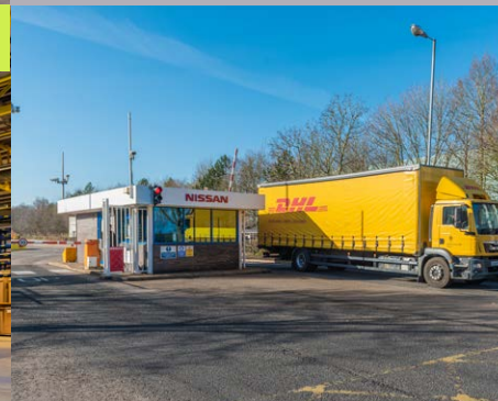
↑ 24/7 MANNED SECURITY