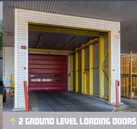
↑ 2 GROUND LEVEL LOADING DOORS