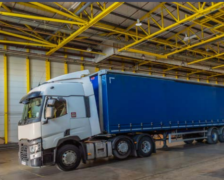
↑ 9.6M MINIMUM EAVES HEIGHT