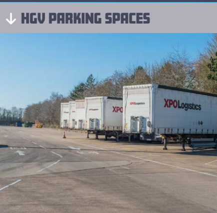
↓ HGV PARKING SPACES