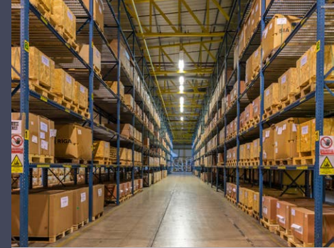
↑ SODIUM PENDANT & FLUORESCENT STRIP LIGHTING

The warehouse benefits from the following features and specification.