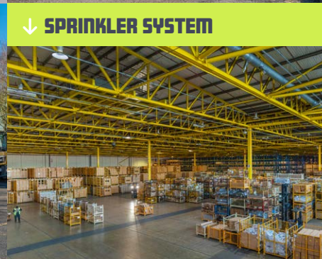
↓ SPRINKLER SYSTEM