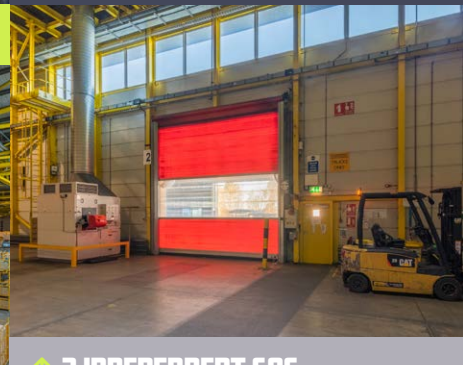
↑ 3 INDEPENDENT GAS FIRED HEATERS