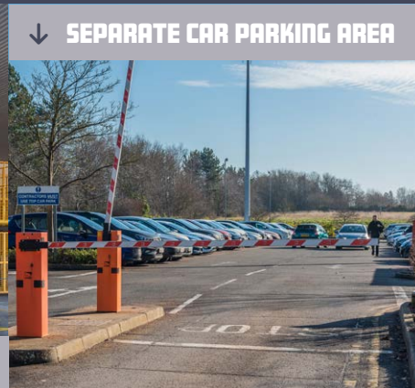
↓ SEPARATE CAR PARKING AREA