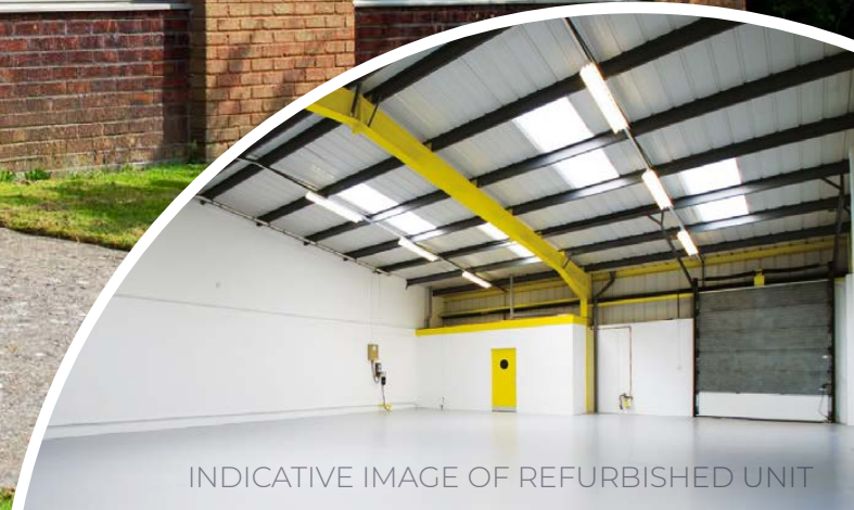
INDICATIVE IMAGE OF REFURBISHED UNIT