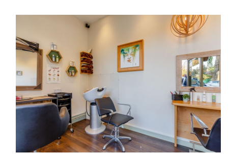
Rent: £15,000 Per annum Size: 330 Square feet Ref: #3123 Status: Available