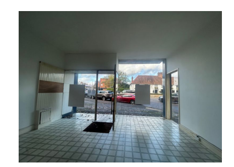
Rent: £45,000 Per annum Size: 760 Square feet Ref: #3125 Status: Reduced