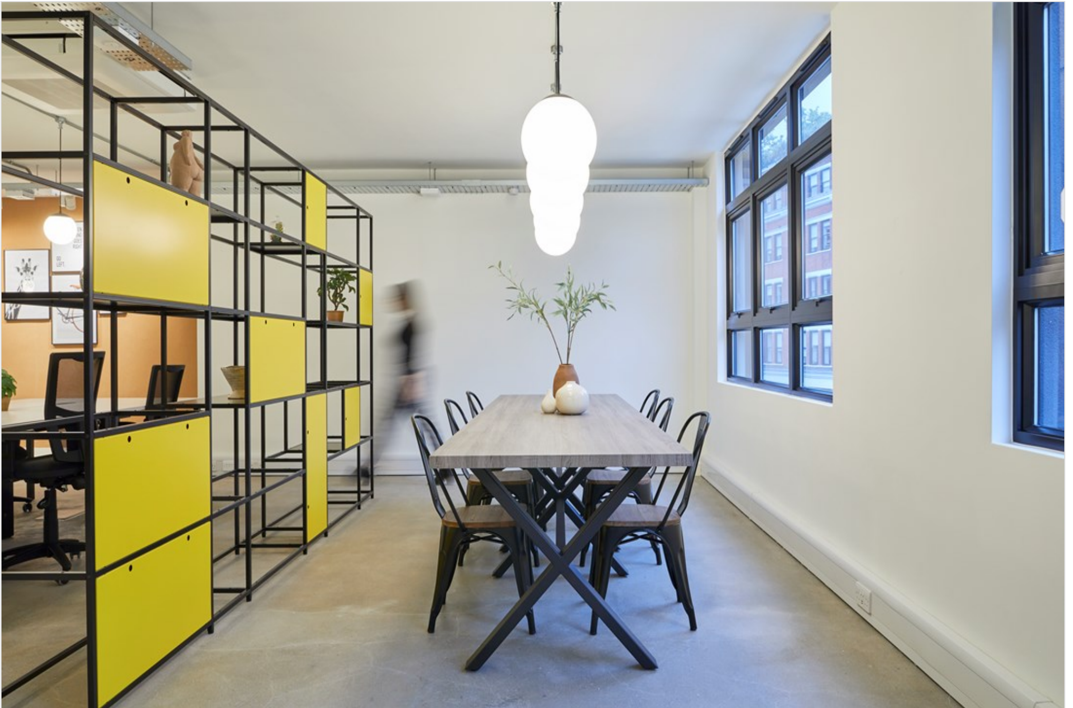
Tabard Works, 6 Tabard Street, London, SE1 4JU