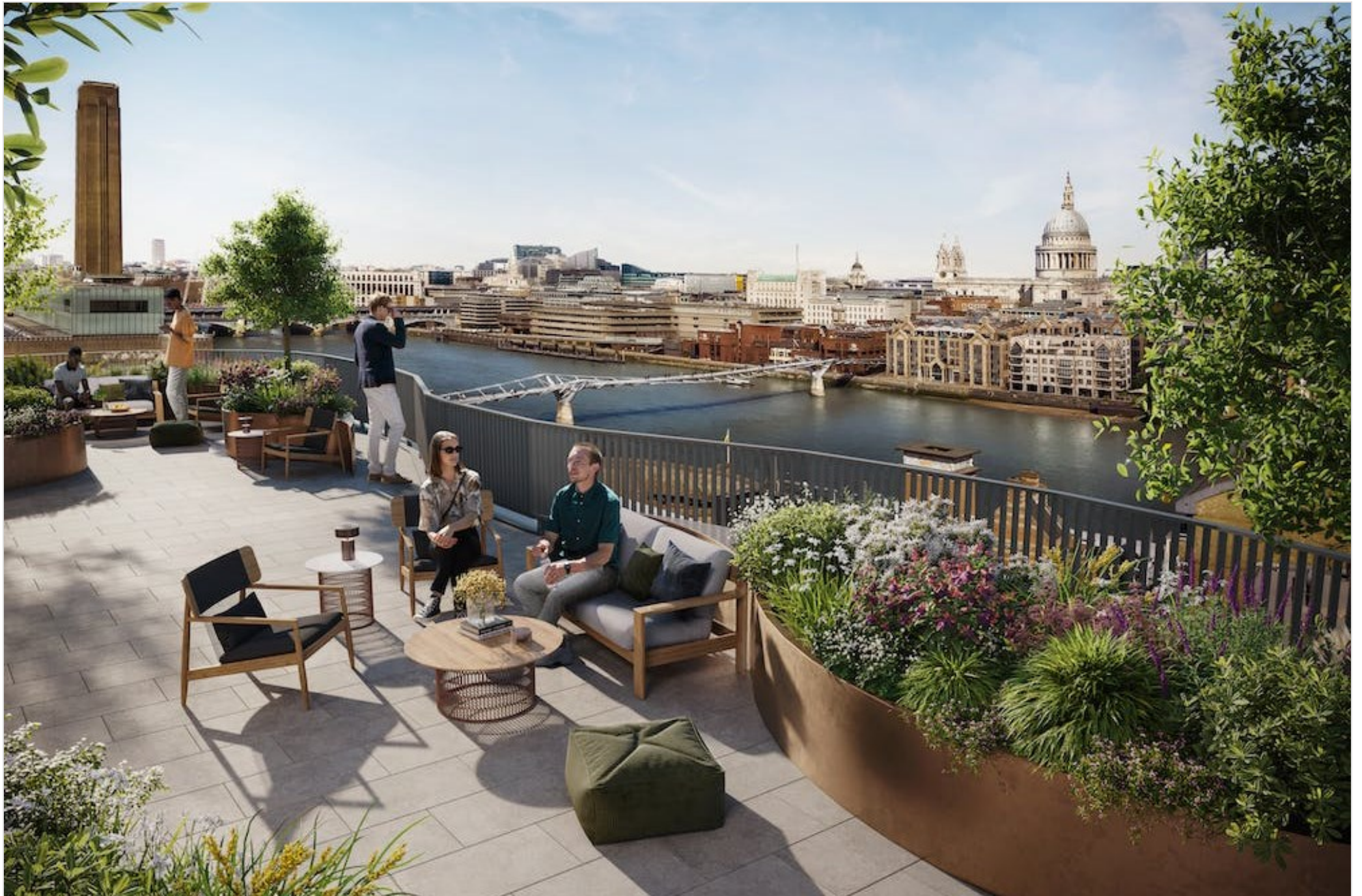
Tide Building, 135 Park Street, London, SE1 9EA