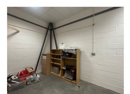
Rent: £18,000 Per annum + VAT Size: 1,666 Square feet Ref: #3110 Status: Reduced