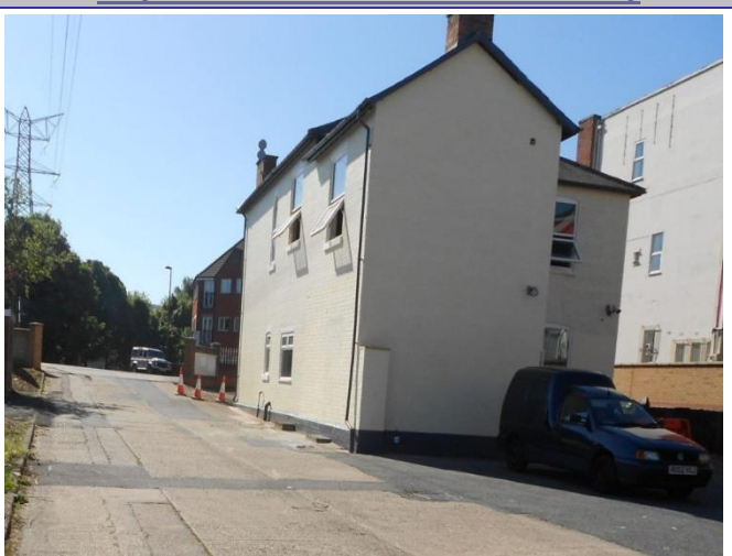
Haye House From the Road