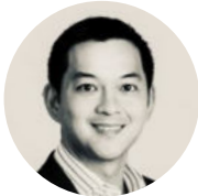
Chue Li Property Consultant

✉ latifacisu@whozoo.co.uk ☎ 0333 200 8330