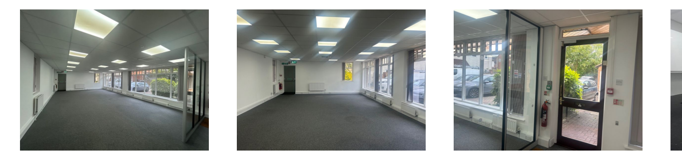
Rent: £45,000 Per annum Size: 1,620 Square feet Ref: #3084 Status: Available