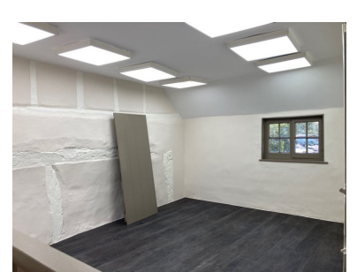
Rent: £42,500 Per annum Size: 900 Square feet Ref: #3073 Status: Available