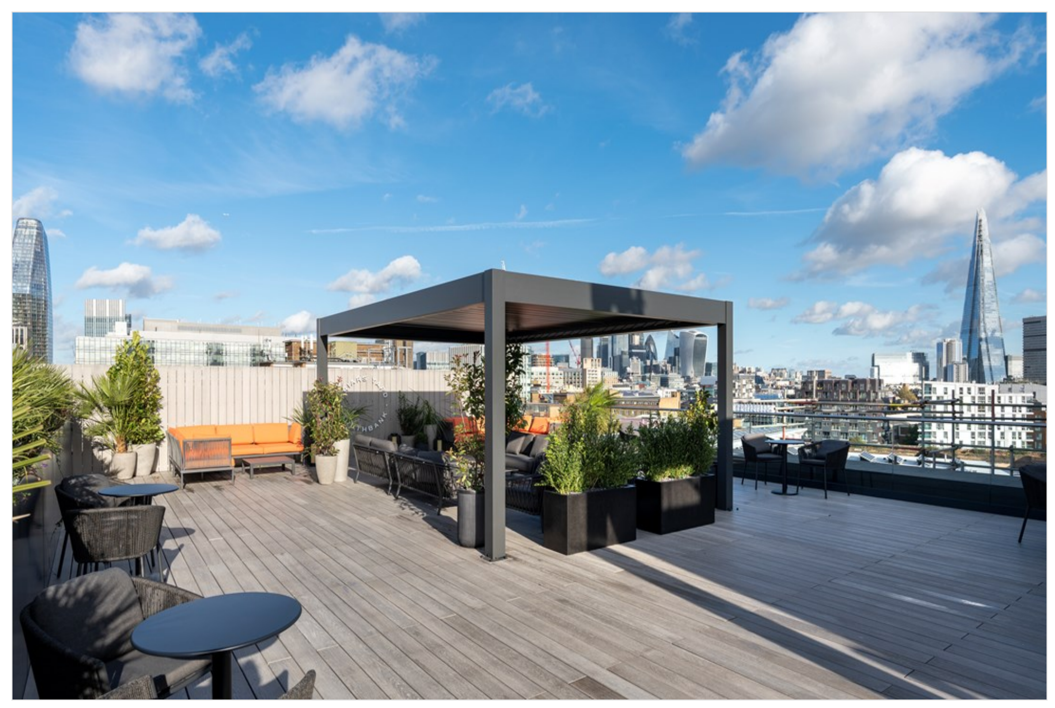
Friars Yard, 160 Blackfriars Road, London, SE1 8EZ