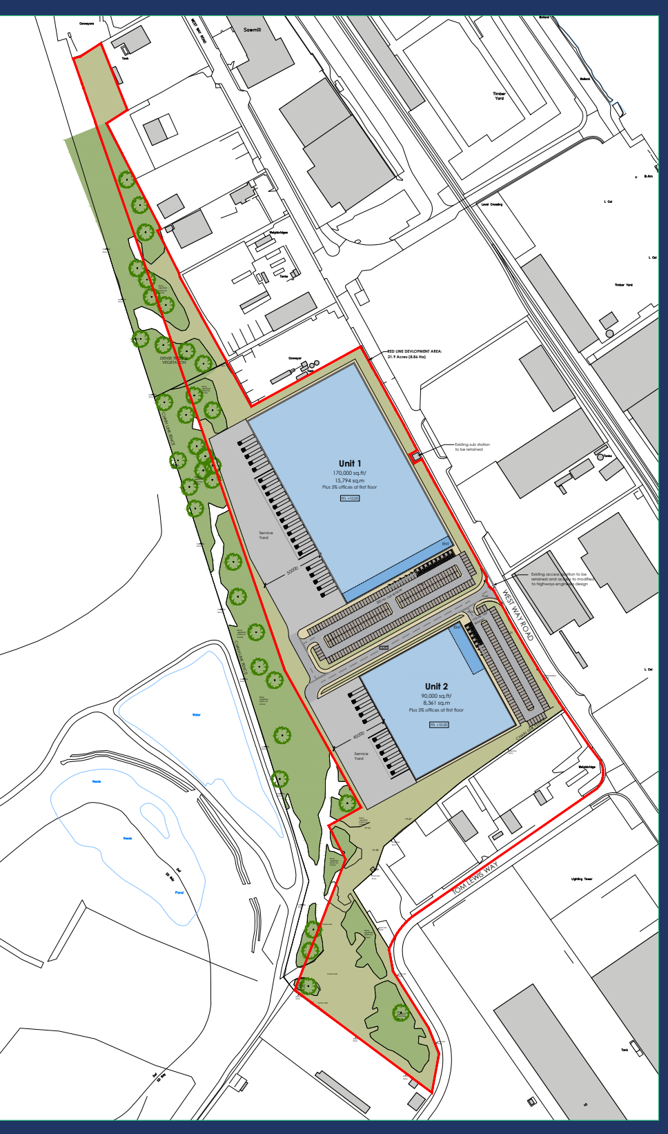
The scheme illustration shown above could be extended to include existing accommodation.