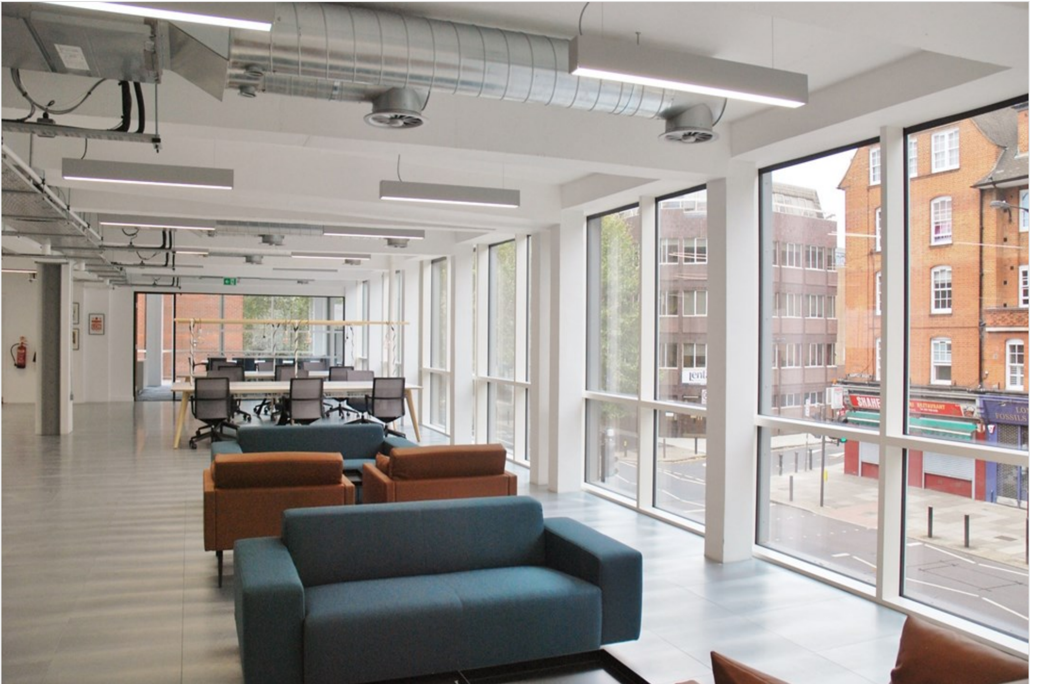
250 Waterloo Road, London, SE1 8UL