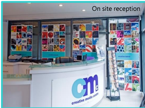
On site reception