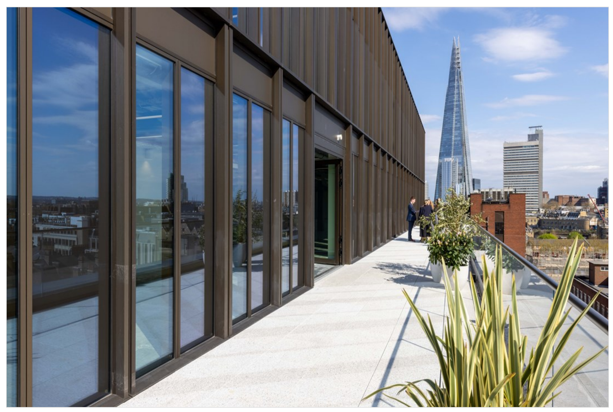
The Forge , 105 Sumner Street, London, SE1 9HZ