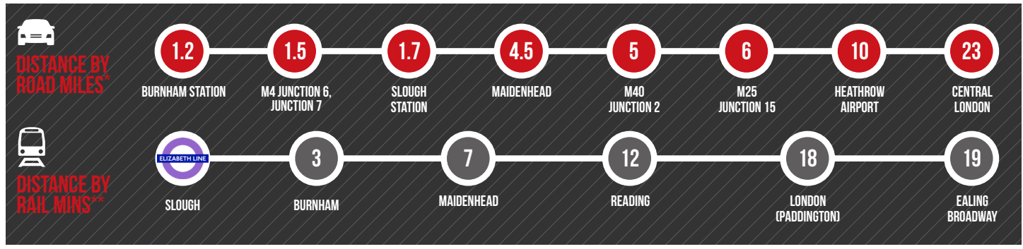
SOURCE: * FROM 350 EDINBURGH AVENUE SL1 4TU. SOURCE: THE AA ** TIMES FROM SLOUGH STATION. SOURCE: NATIONAL RAIL ENQUIRIES