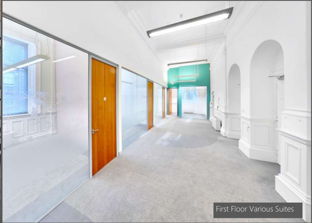
First Floor Various Suites