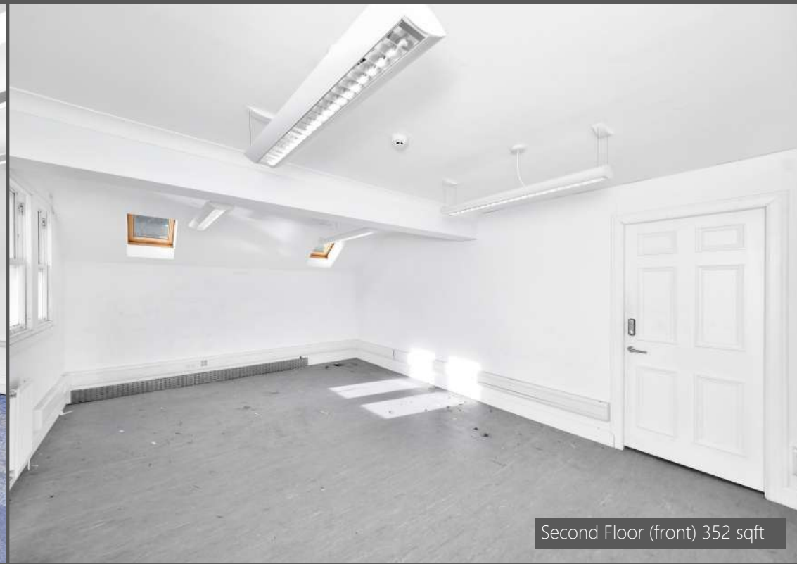
Second Floor (front) 352 sqft