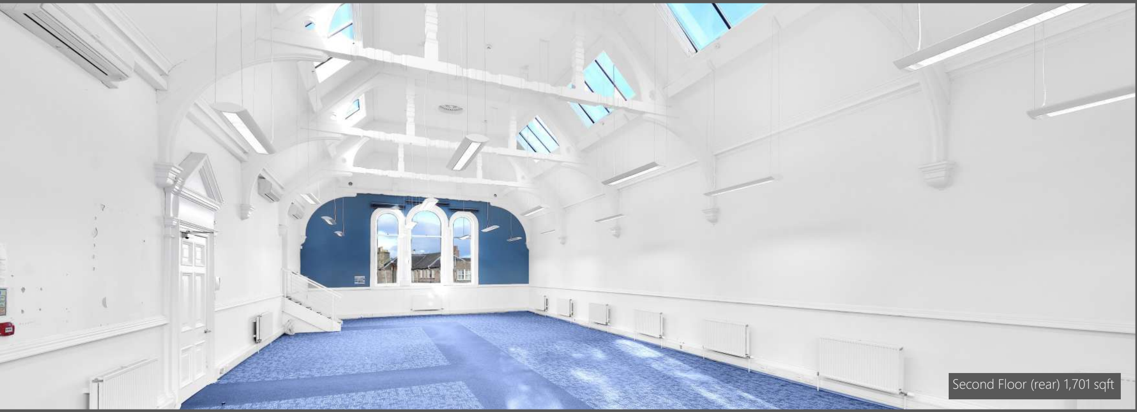
Second Floor (rear) 1,701 sqft