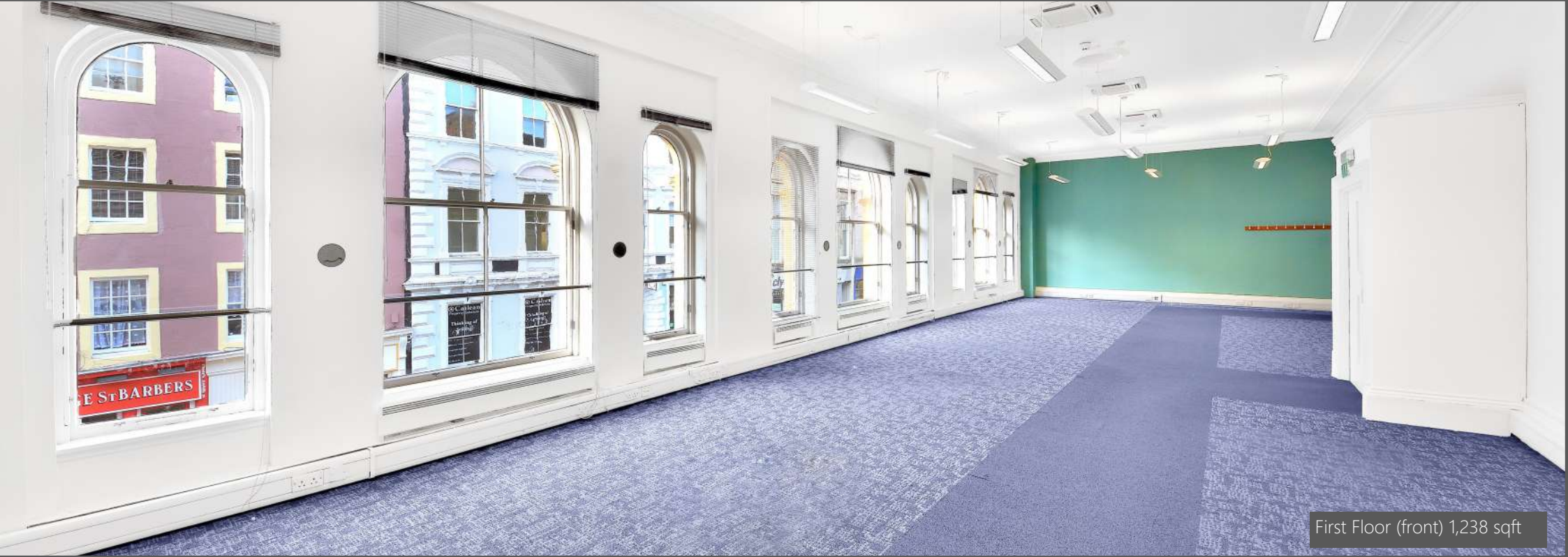
First Floor (front) 1,238 sqft