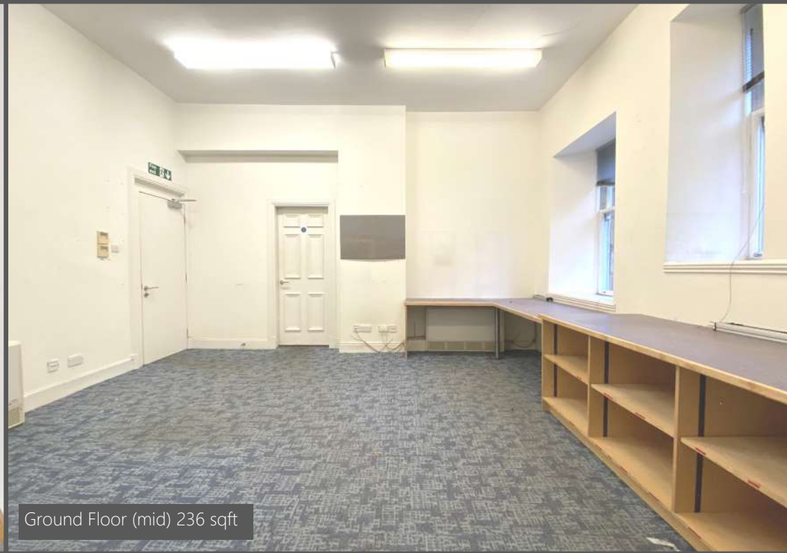
Ground Floor (mid) 236 sqft