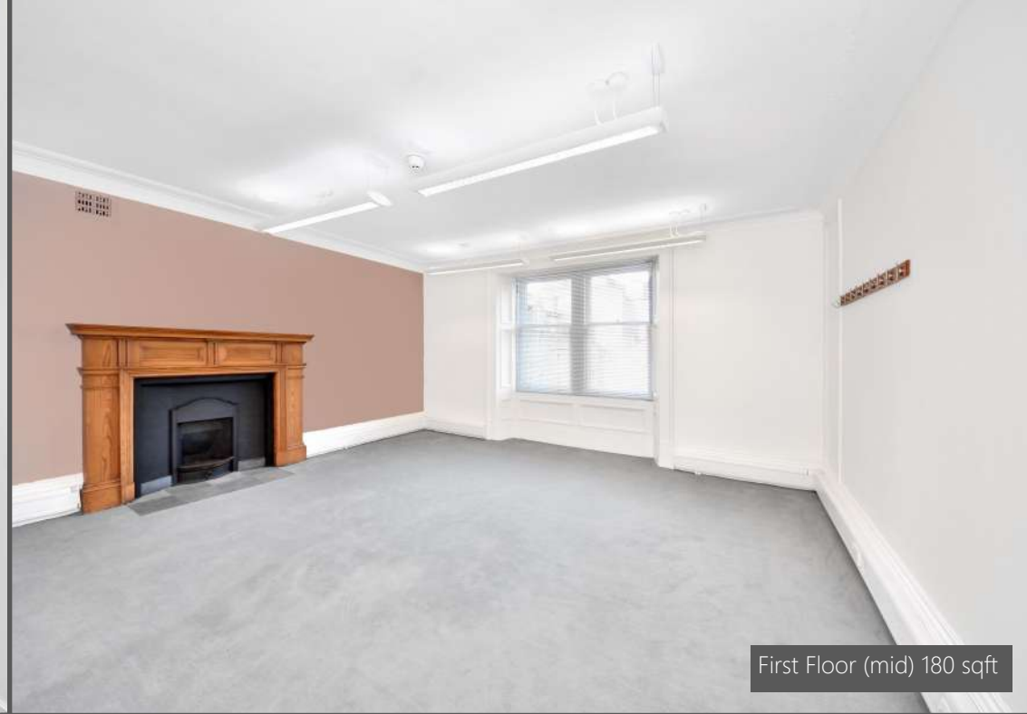
First Floor (mid) 180 sqft