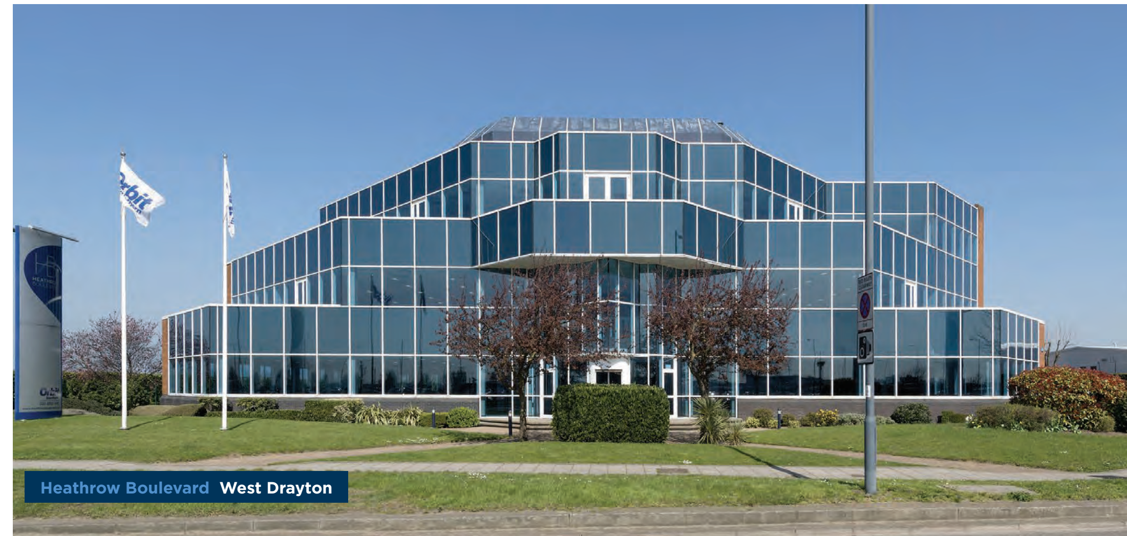
Heathrow Boulevard West Drayton

We have a dedicated in-house property management team who are responsible for the day to day management of the portfolio and liaison with our clients. Our larger multi-let buildings and business parks have building managers working within the facilities management team who are based on-site providing immediate client facing support.