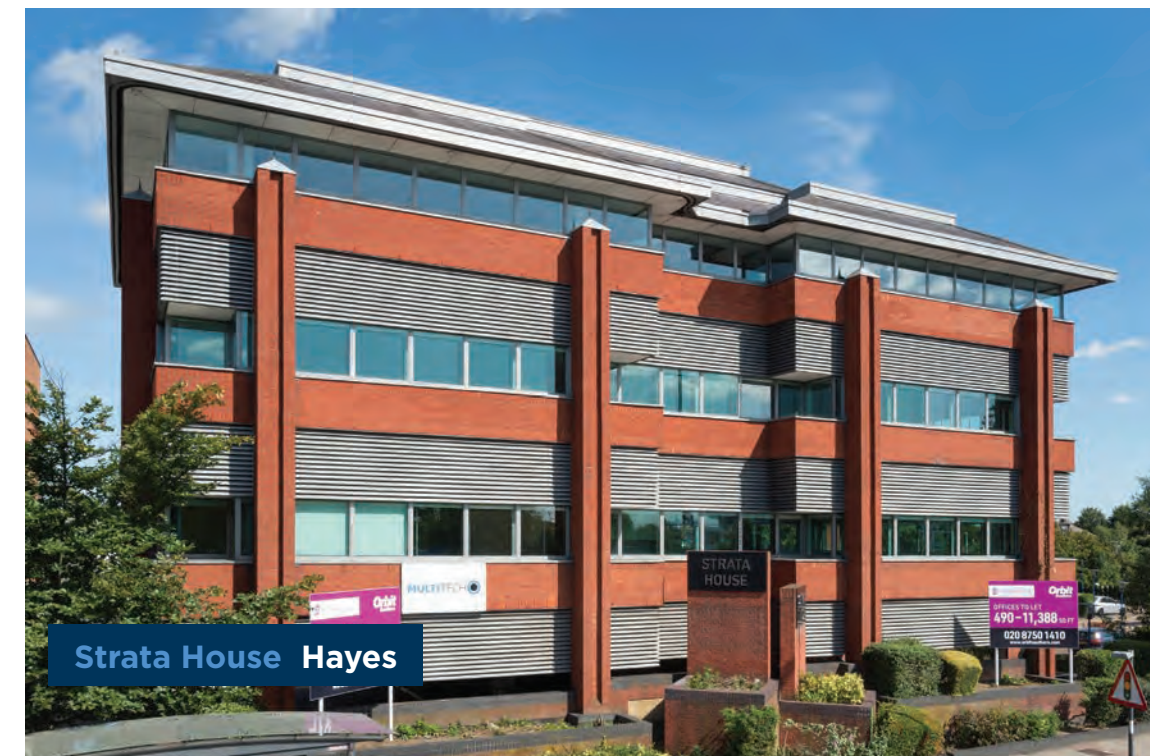
Strata House Hayes