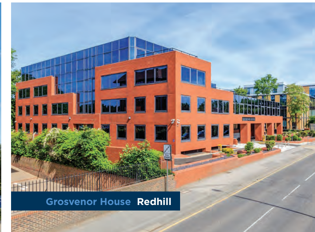
Grosvenor House Redhill

IF YOU NEED SPACE TO OPERATE YOUR BUSINESS - MAKE IT OUR BUSINESS TO FIND YOU THAT SPACE.