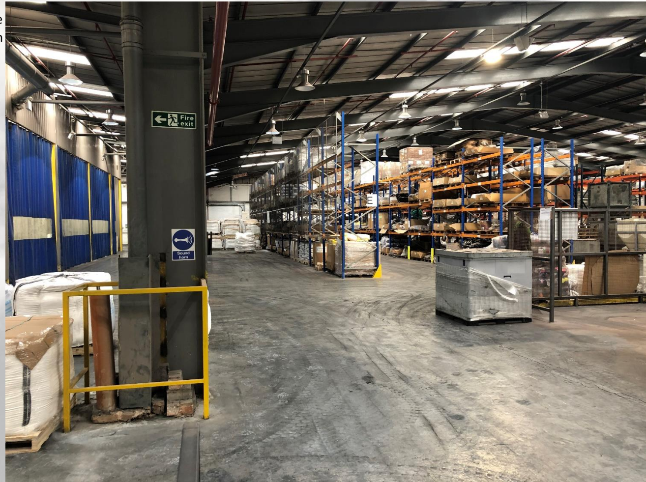
Photograph taken 2021