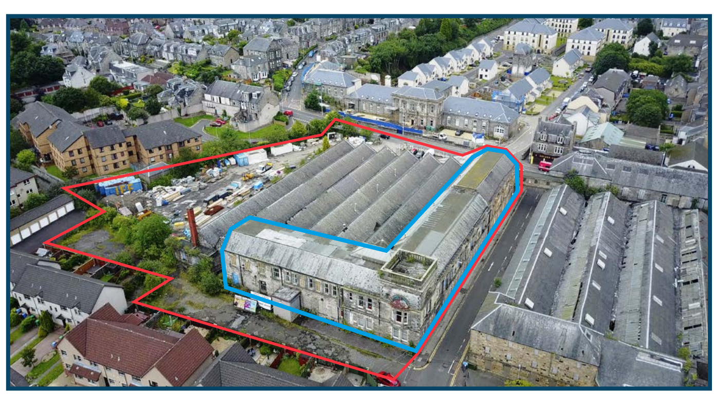
The above photo shows the site outlined in red with the portion of the building to be retained outlined in blue.