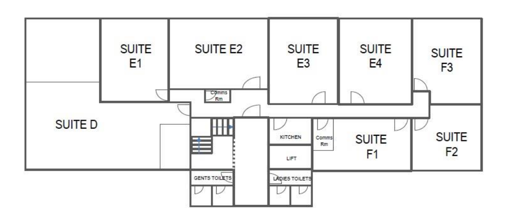
RIVERVIEW HOUSE - SECOND FLOOR