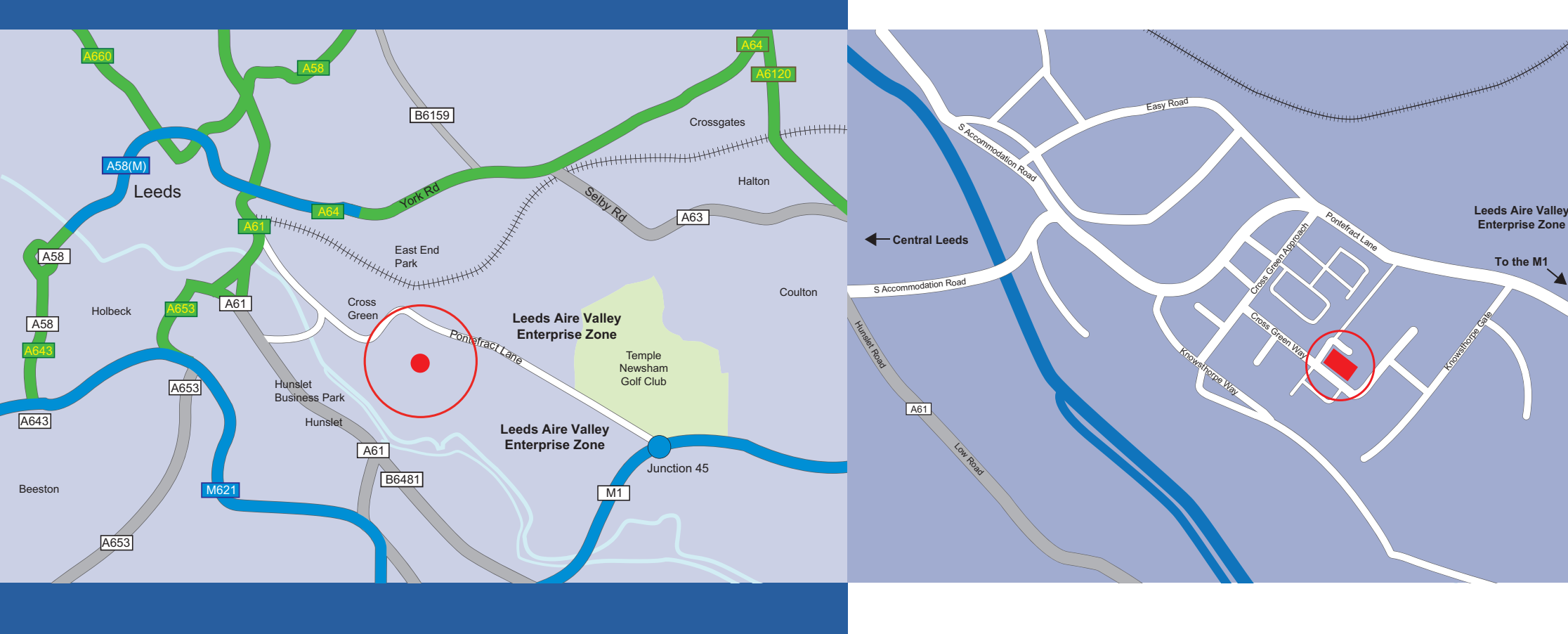
Units 1 & 2, Hapco House, Cross Green Way, Leeds, LS9 0SE