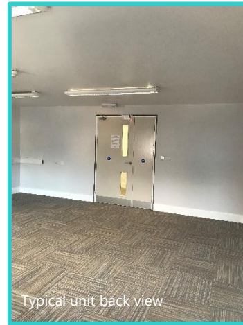
Typical unit back view

Rent and service charges are invoiced quarterly in advance and clients can opt to pay monthly by direct debit.