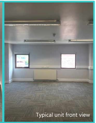
Typical unit front view