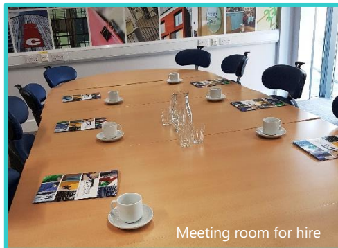
Meeting room for hire