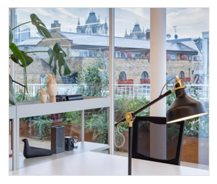
Nutmeg House, 60 Gainsford Street, London, SE1 2NY