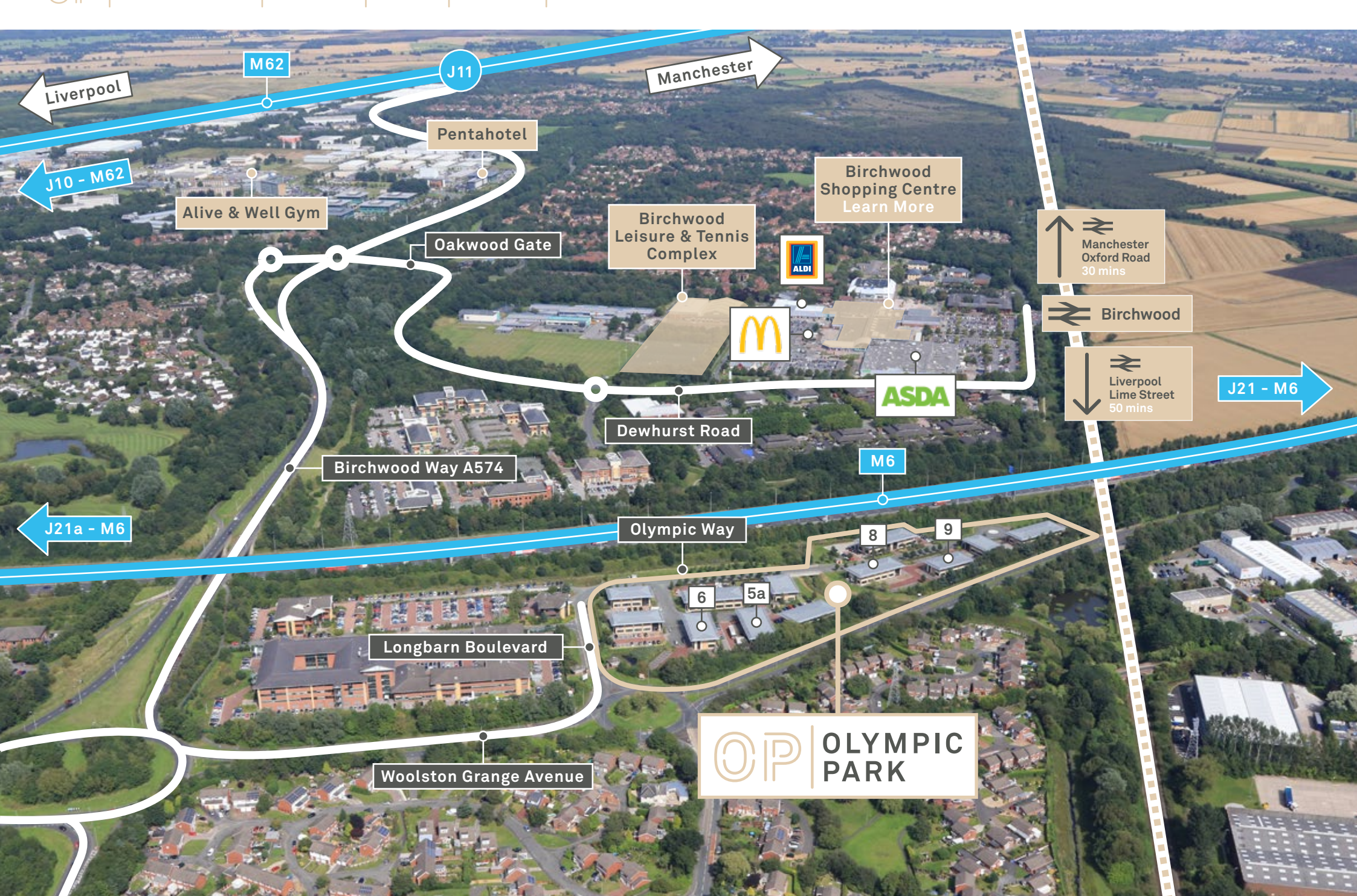
Image: Point of the buildings LOCATION AERIAL GALLERY TERMS & CONTACT