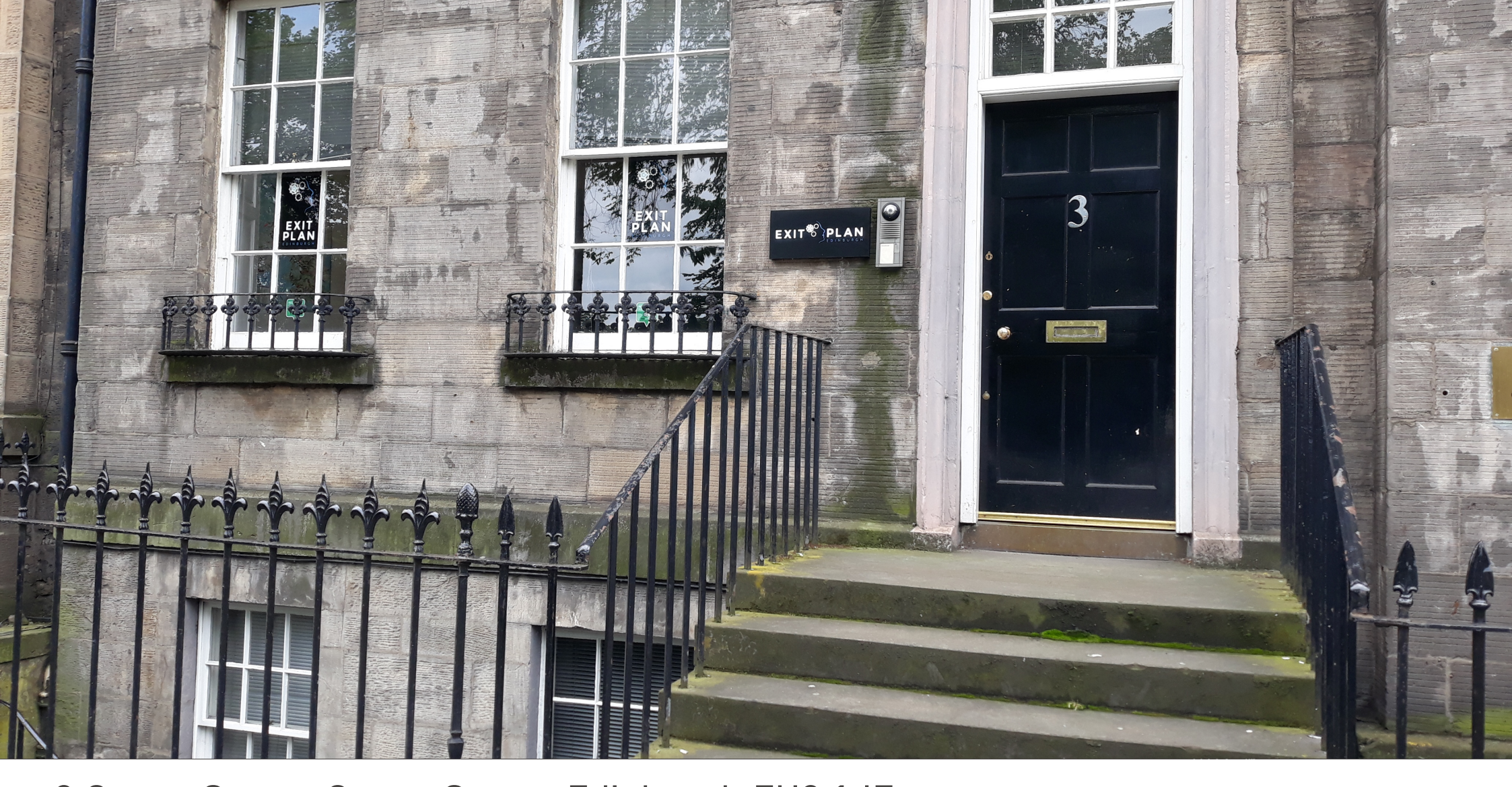
3 Queen Street, Queen Street, Edinburgh EH2 1JE