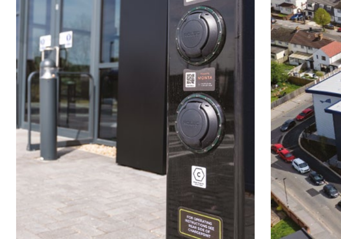
EPC A+ Rating