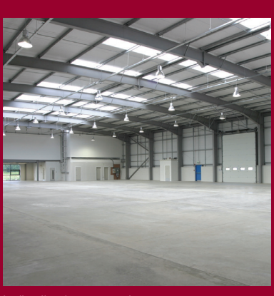
Indicative images only