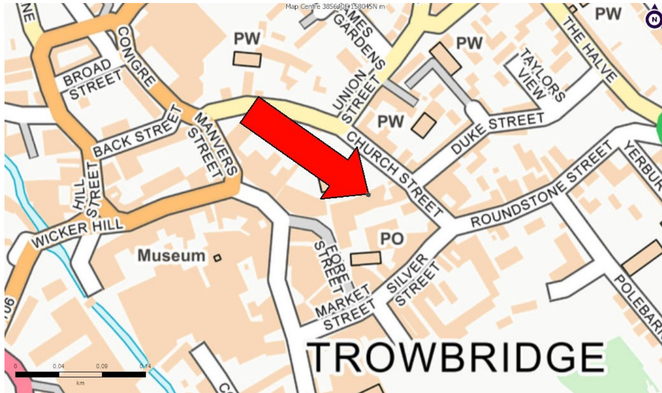
For Identification Purposes Only