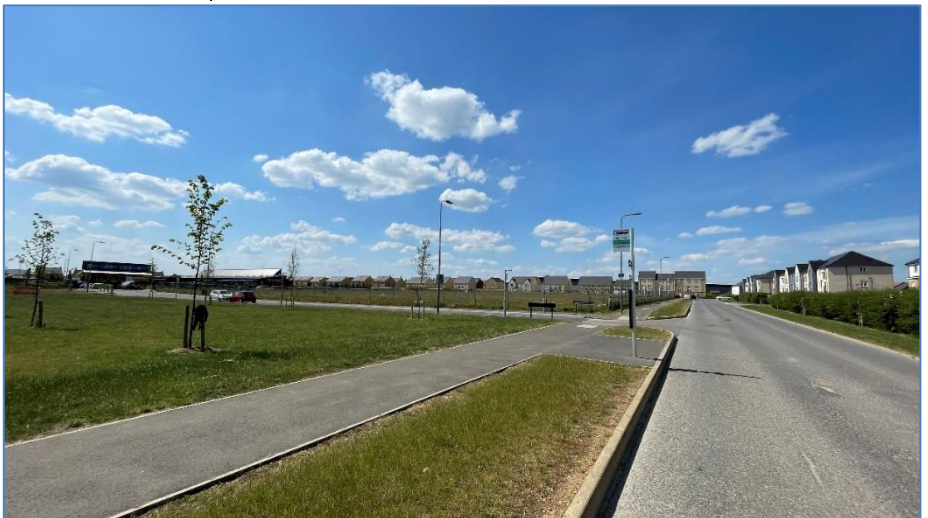
View from Centenery Way (from South of site towards North-West).