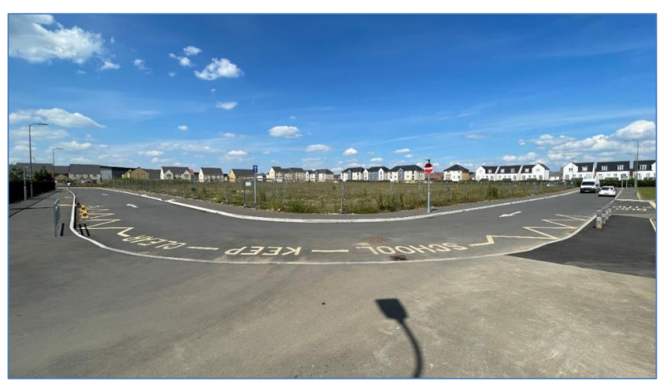
View from school entrance (from South corner towards North).