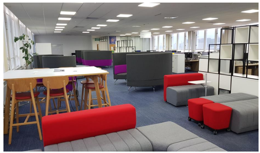
Indicative photo of possible layout