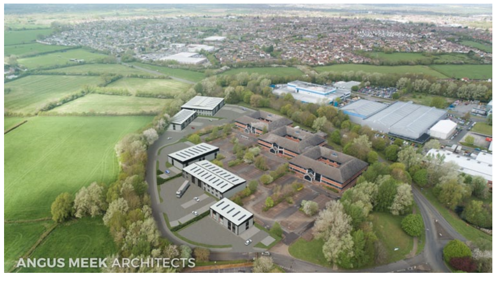
Illustration for Indicative Purposes Only