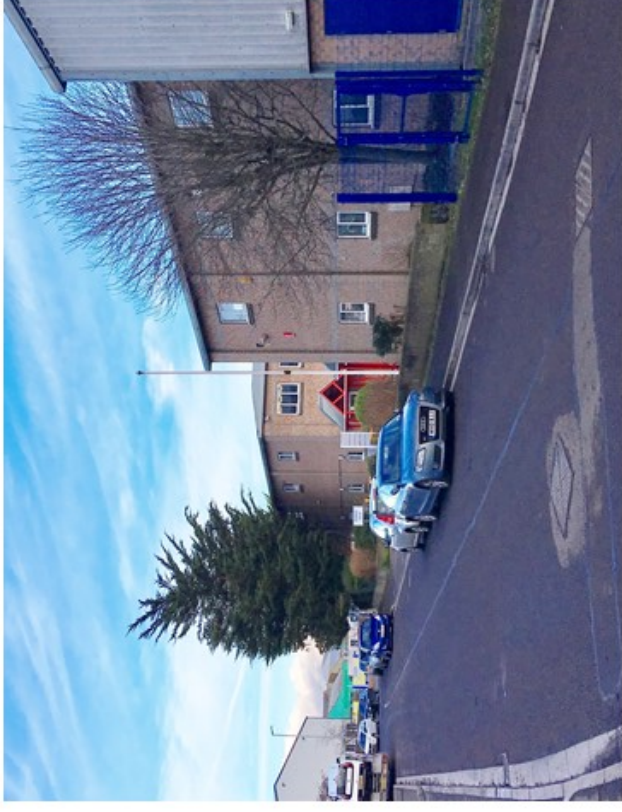
View to East