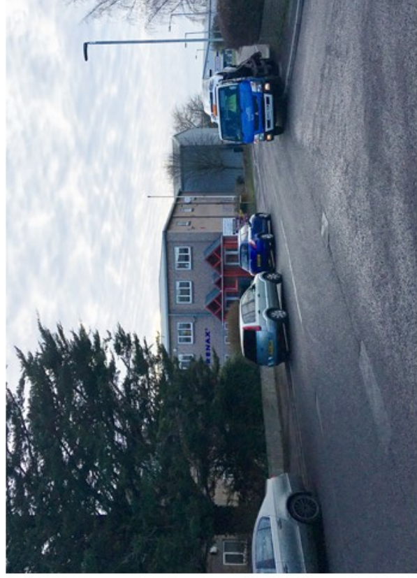
View to West