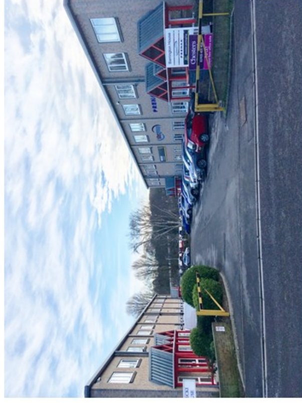
Entrance to Scheme