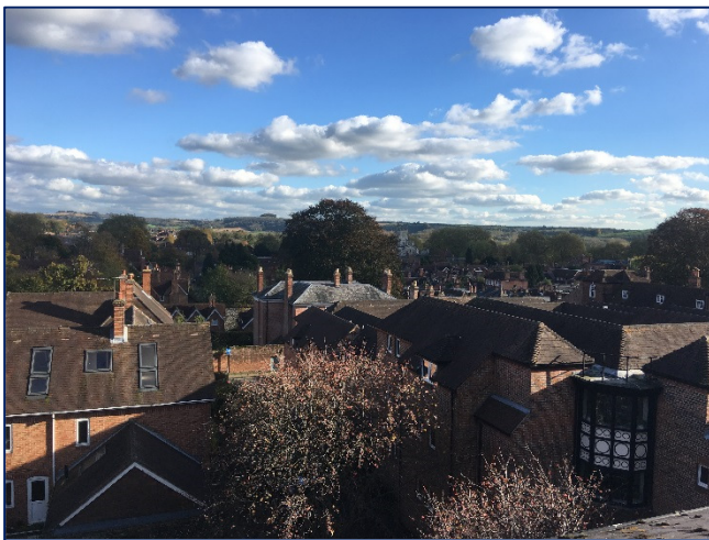
View from the office window

There is the potential for car parking on a short term basis by way of separate negotiation.