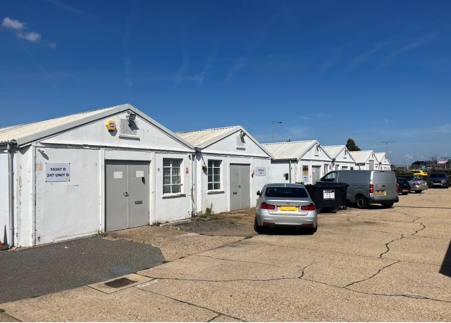
Indicative warehouse photo