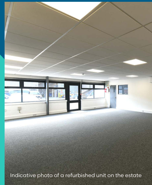
Indicative photo of a refurbished unit on the estate