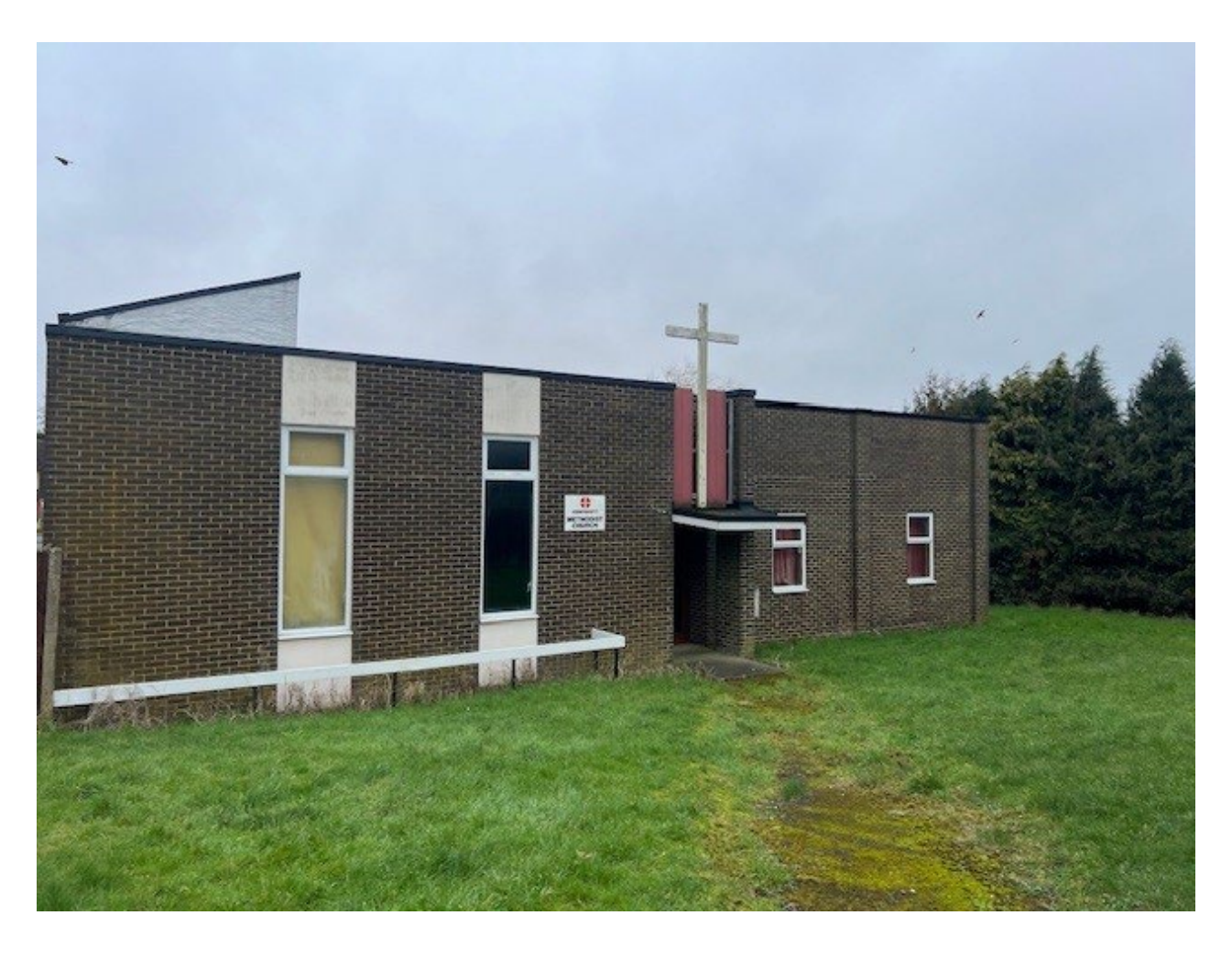
View of the property looking north-west