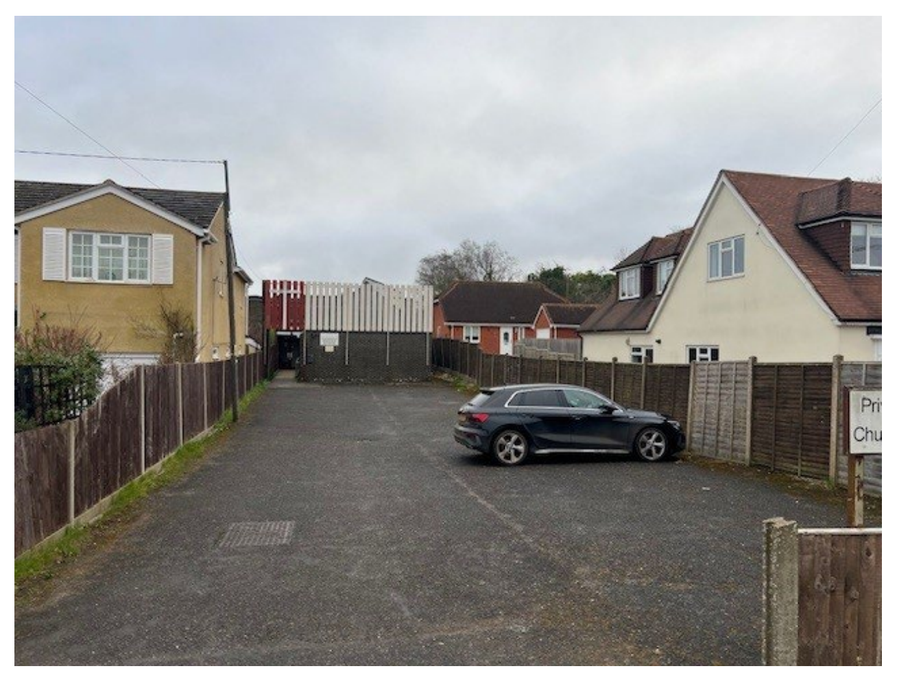
View of property looking east from Kempshott Lane