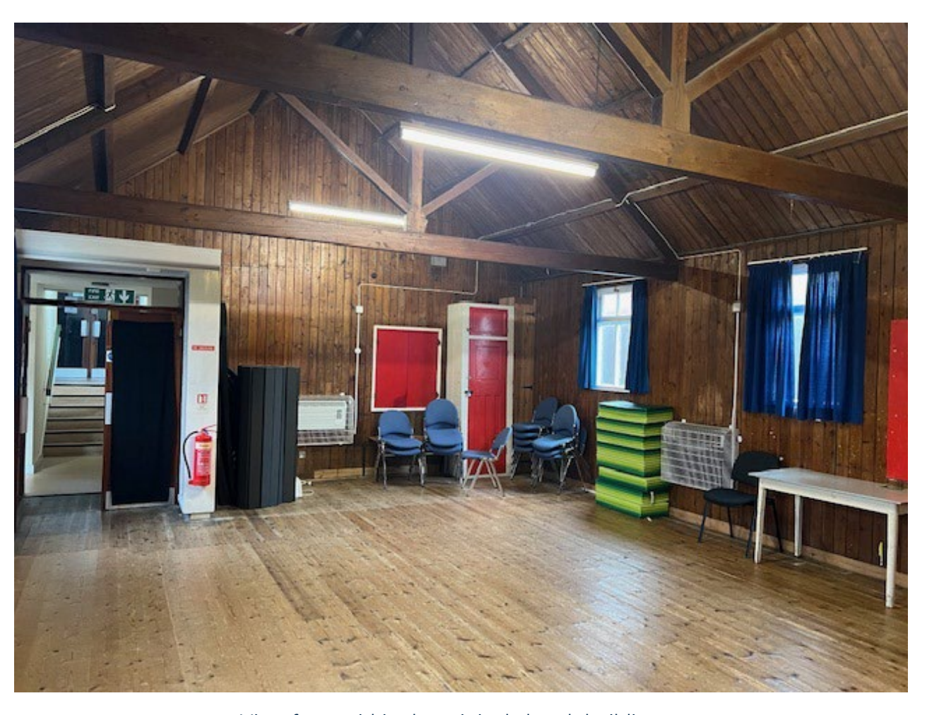
View from within the original church building