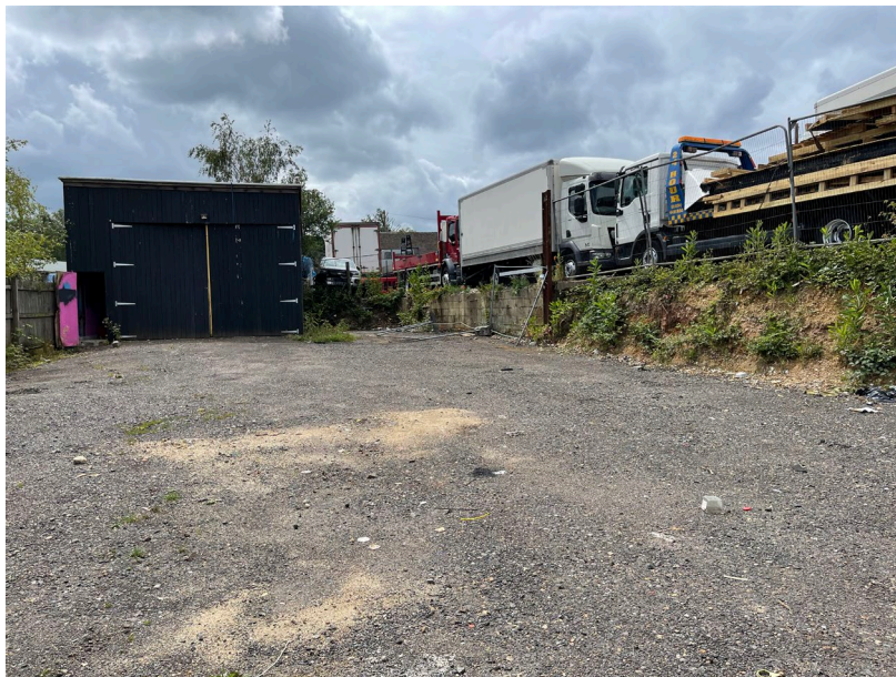
Open Storage Land