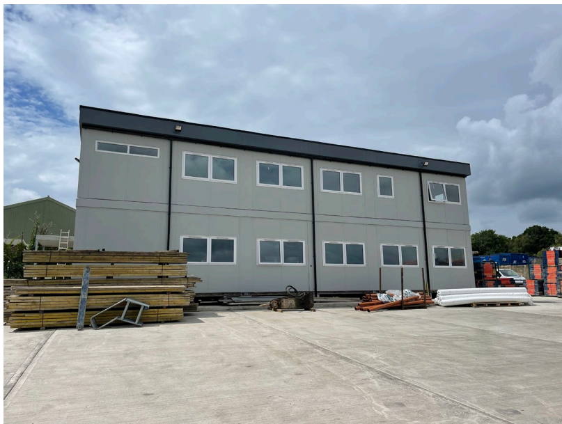
On Site Offices available