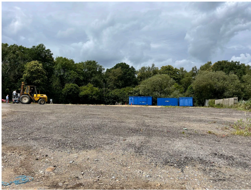
Open Storage Land